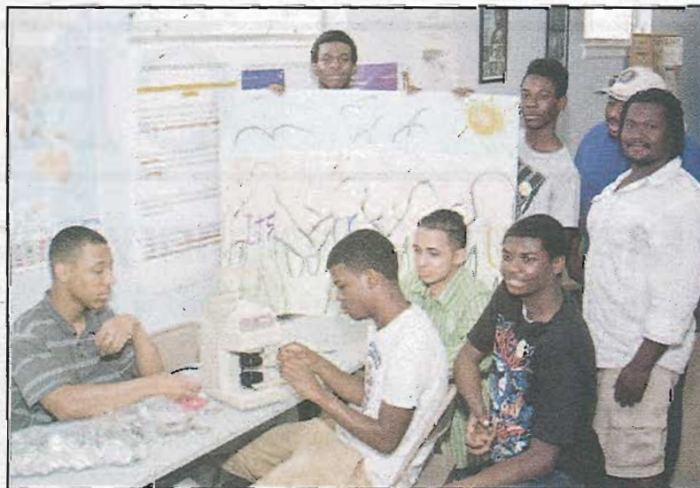
Students display a poster while others make lapel buttons that have the slogan "It's OK 2 B U"